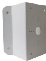
DS-1276ZJ-SUS Corner mount