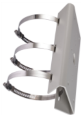
DS-1275ZJ-SUS Vertical Pole mount